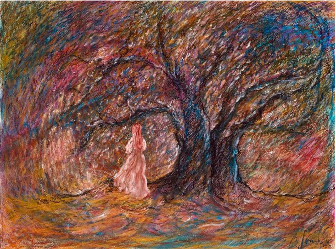
BRIGITTE GAUTSCHI Finding Peace , 2022 Oil Pastel on Linen Framed: 23.5 x 29.5 "