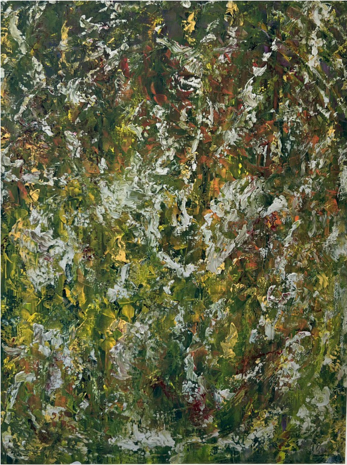
BRIGITTE GAUTSCHI New Era , 2022 Oil on Linen Framed: 29.5 x 23.5 "