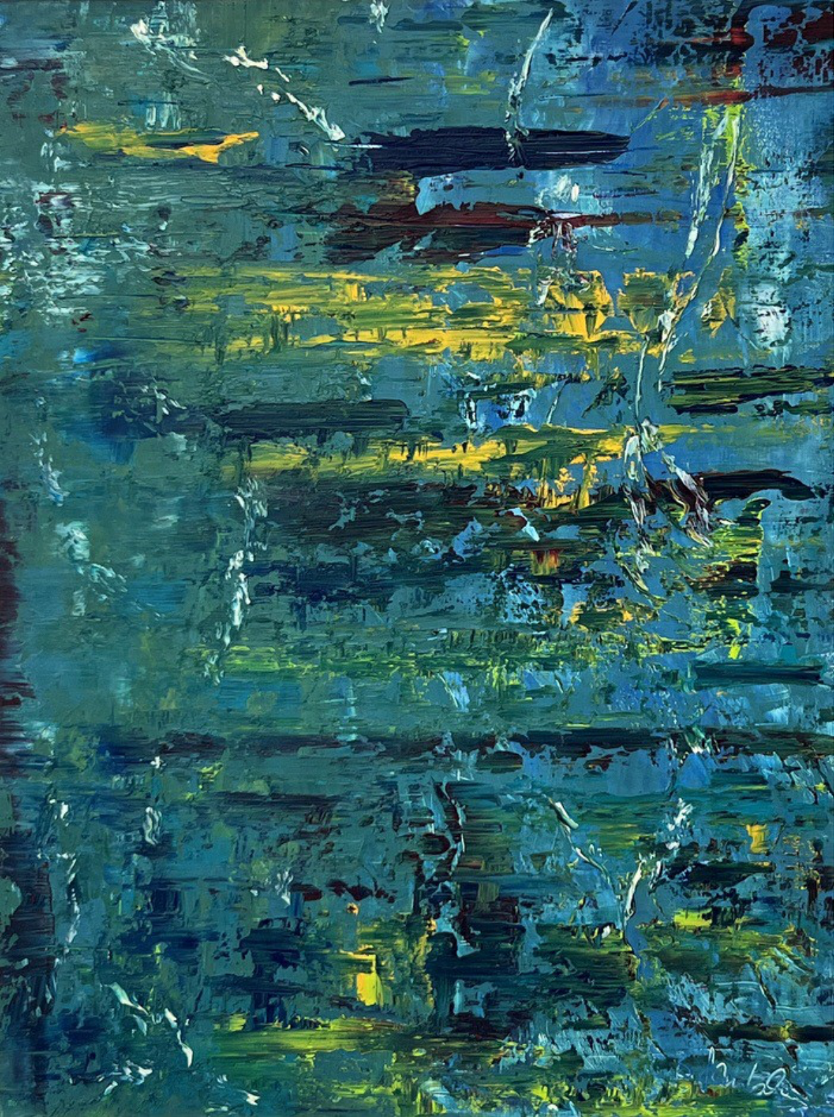
BRIGITTE GAUTSCHI Crystal Cave , 2022 Oil on Linen Framed: 29.5 x 23.5 "