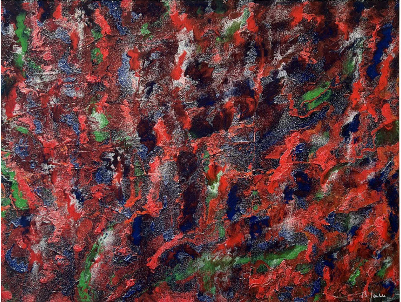
BRIGITTE GAUTSCHI Heaven To Earth , 2022 Oil on Linen Framed: 23.5 x 29.5 "