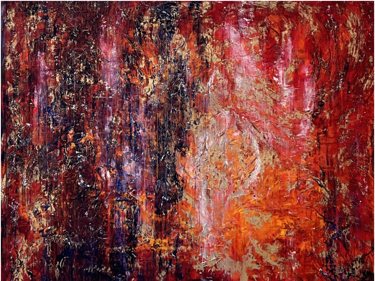
BRIGITTE GAUTSCHI Spiritual Eclipse , 2022 Oil on Linen Framed: 23.5 x 29.5 "