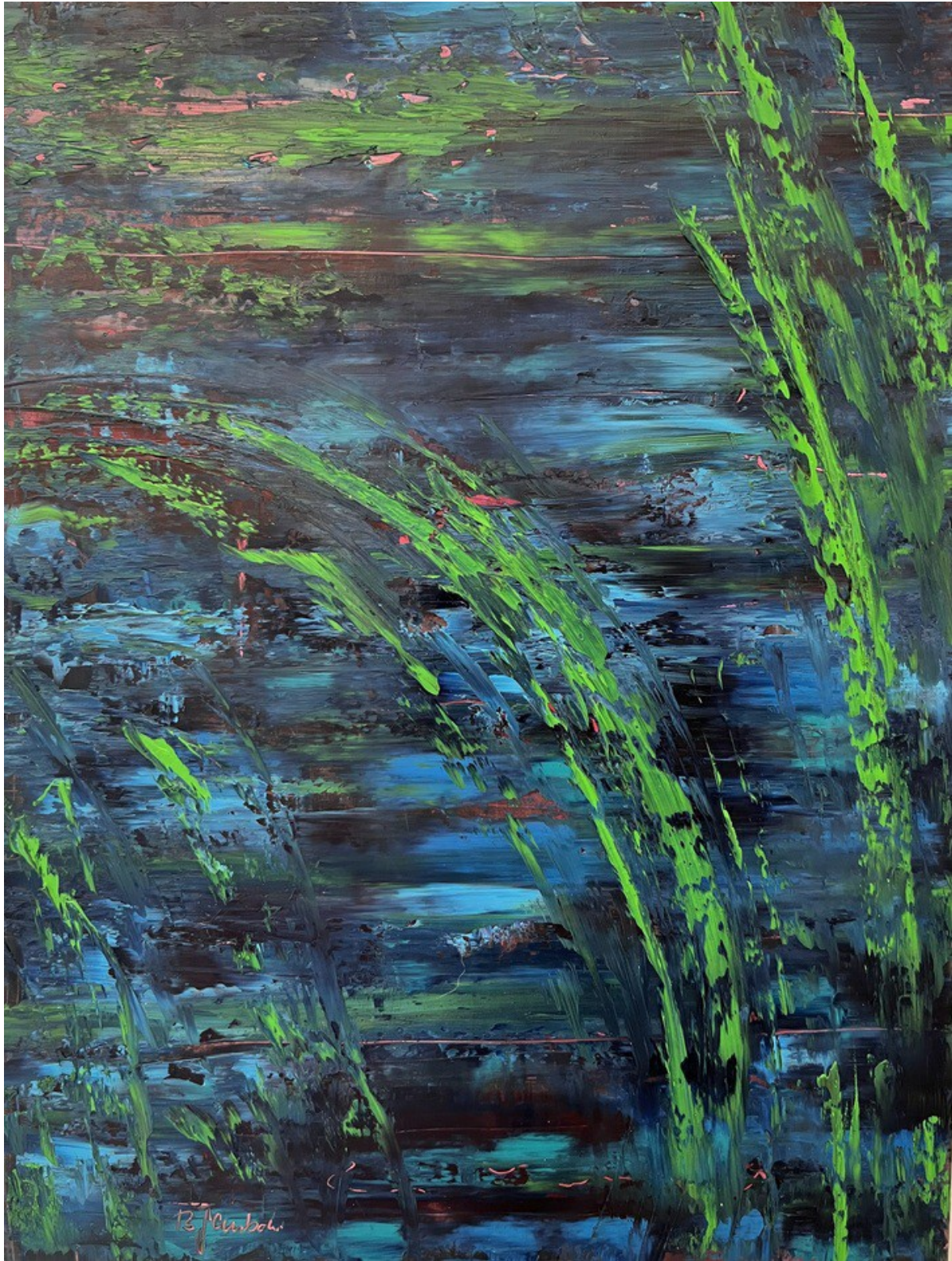
BRIGITTE GAUTSCHI Sea Grass , 2022 Oil on Linen Framed: 29.5 x 23.5 "