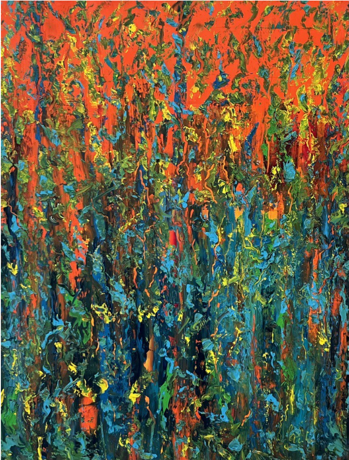
BRIGITTE GAUTSCHI Calypso , 2022 Oil on Linen Framed: 29.5 x 23.5 "