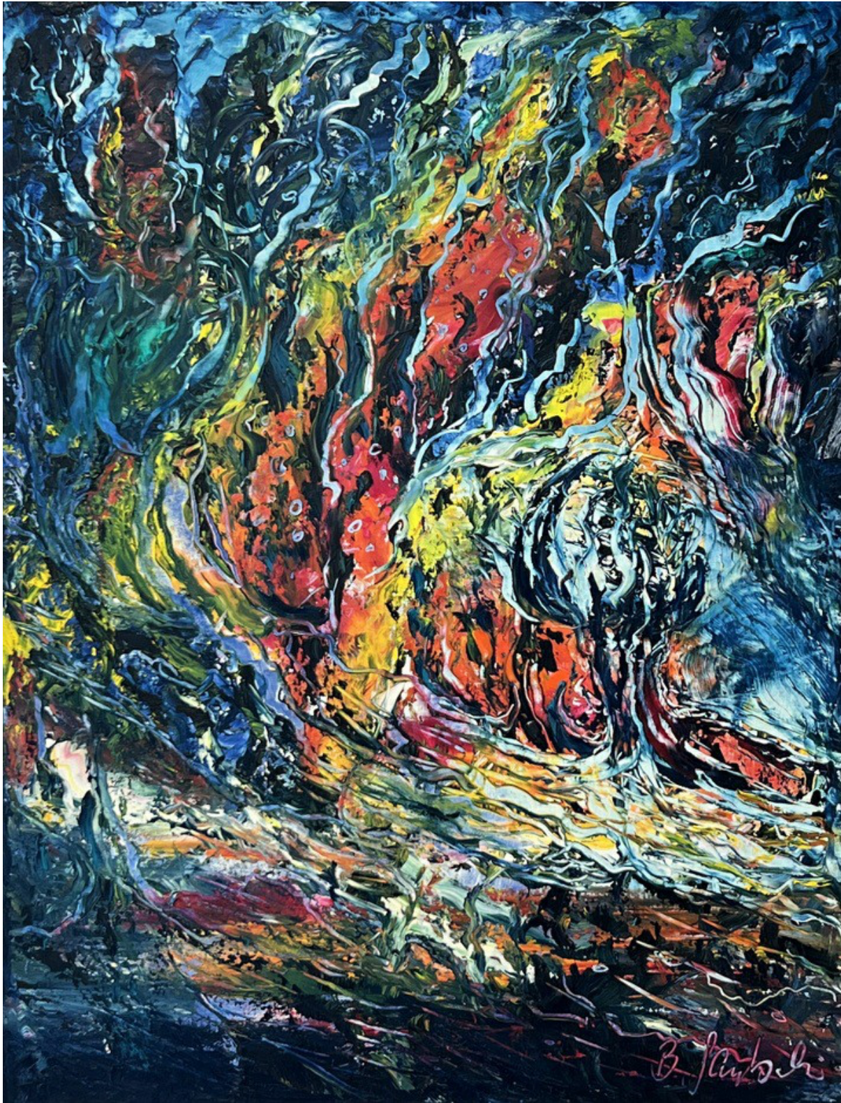
BRIGITTE GAUTSCHI Justice , 2022 Oil on Linen Framed: 29.5 x 23.5 "