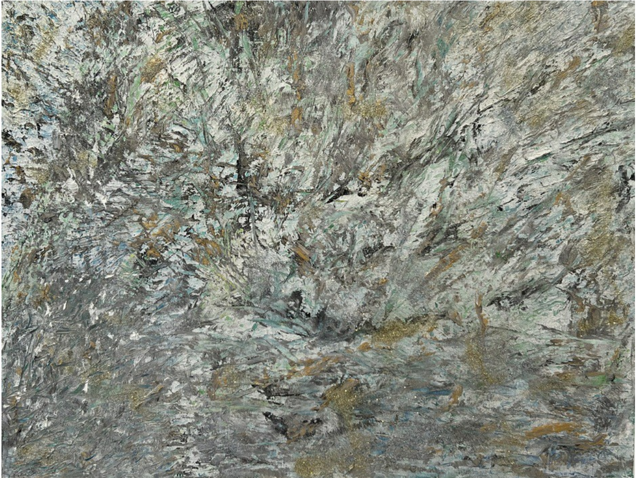
BRIGITTE GAUTSCHI Stormy Sparkles , 2022 Oil on Linen Framed: 23.5 x 29.5 "