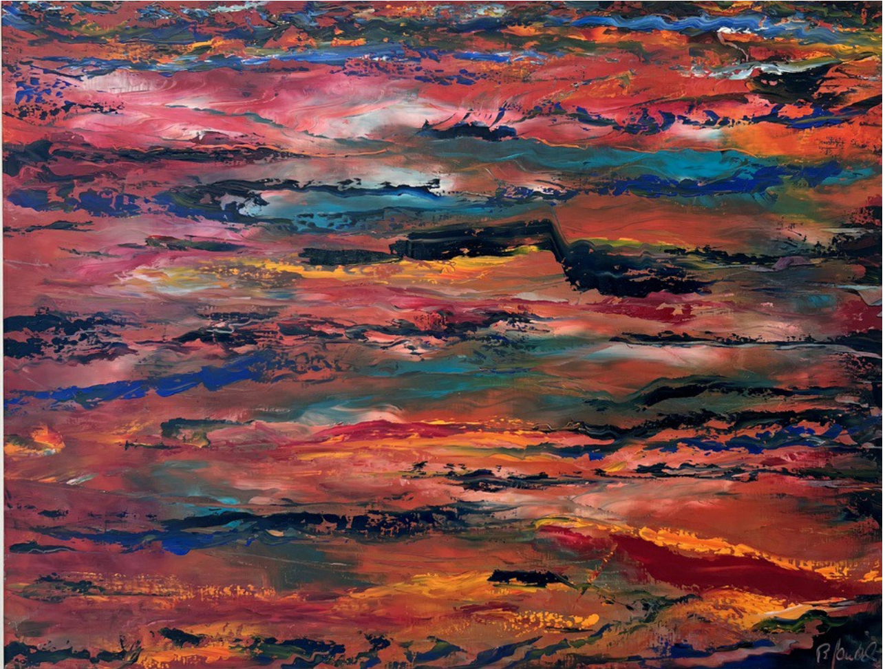
BRIGITTE GAUTSCHI Go With The Flow , 2022 Oil on Linen Framed: 23.5 x 29.5 "