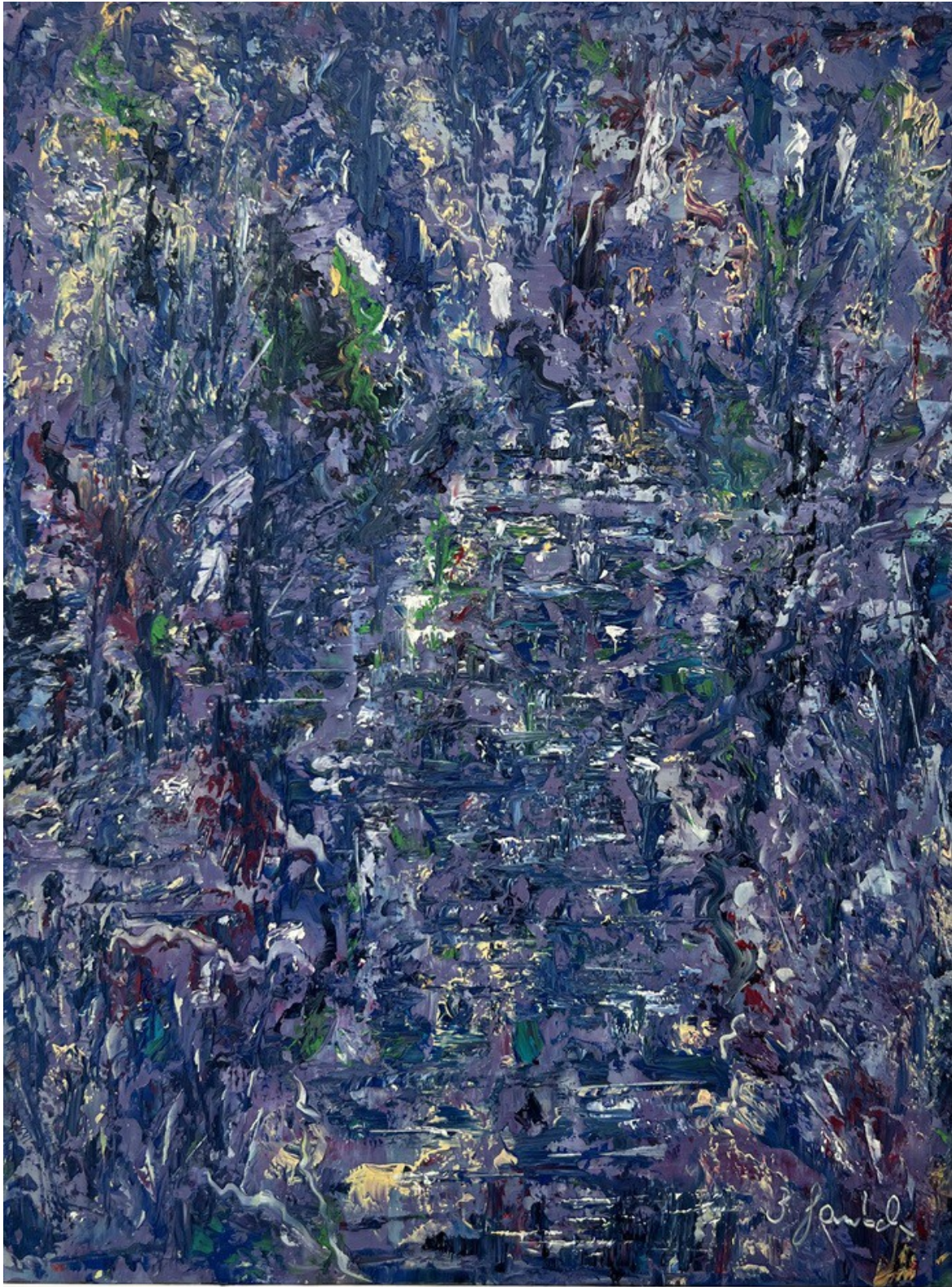
BRIGITTE GAUTSCHI New Messenger , 2022 Oil on Linen Framed: 29.5 x 23.5 "